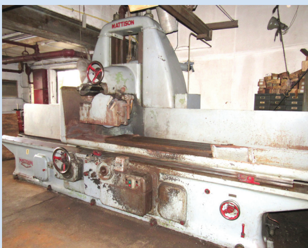
Mattison 16" x 72" Hydraulic Surface Grinder