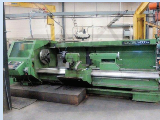
Gurutzpe Model A1000 38" x 120" Flatbed CNC Lathe with Fanuc OT Control