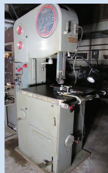
DoAll Model 1612-1 16" Vertical Band Saw