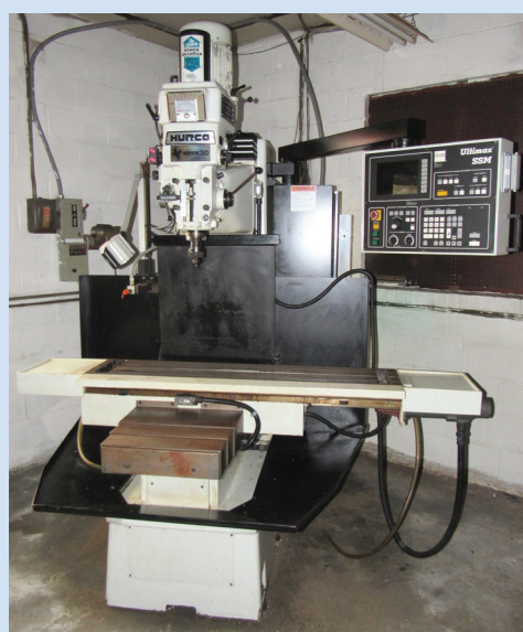
Hurco Model Hawk 30 CNC Bed-Type Milling Machine