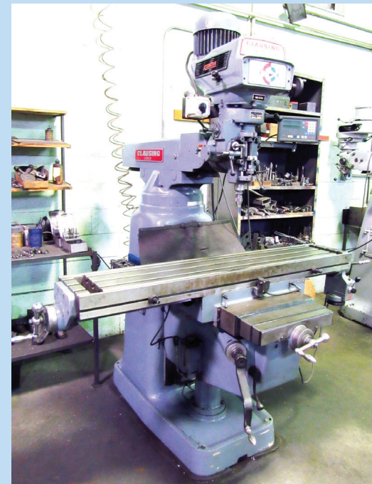
Clausing Kondia Model FV 300 4HP Vertical Milling Machine