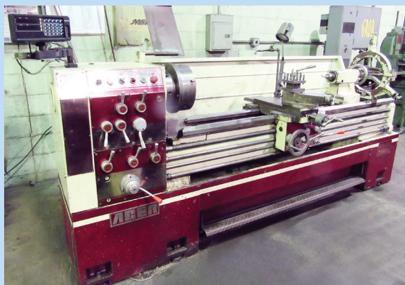
Acer Dynamic Model 2080GH 20"/27.5" x 80" Geared Gap Lathe