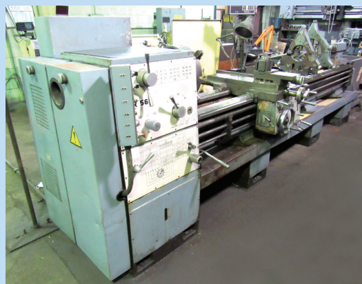
Toolmex-Tur 560 22" x 120" Geared Head Lathe

Featuring Heavy Duty, Well-Maintained Machining Equipment!