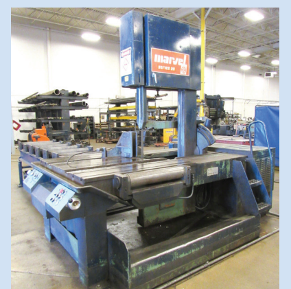
Marvel Series 25/S1 25" Vertical Band Saw