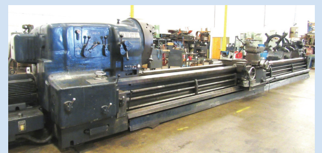
Monarch Lathes to 48" x 324" Capacity