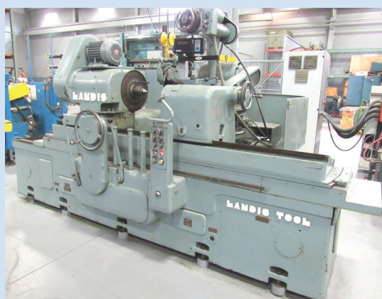
Landis Type CHW 30" x 48" Universal Cylindrical Grinder