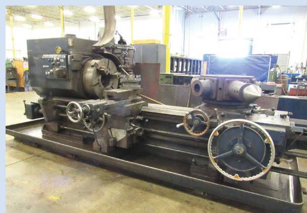
Warner & Swasey Model 4A Universal Saddle-Type Cross-Sliding Turret Lathe