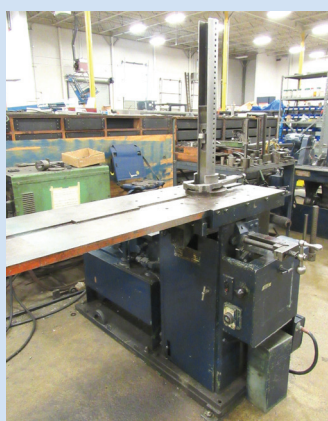
Mitts & Merrill Model 3A Hydraulic Keyseater