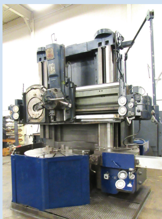
Bullard 56" Dynatrol Vertical Turret Lathe