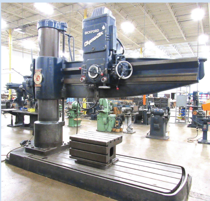
Cincinnati Chipmaster 8' x 19" Radial Drill