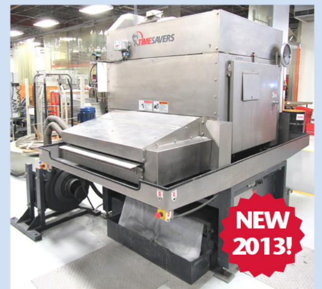
TIMESAVER LYNX 37MWT-DD-60 WET/DRY BELT SANDER