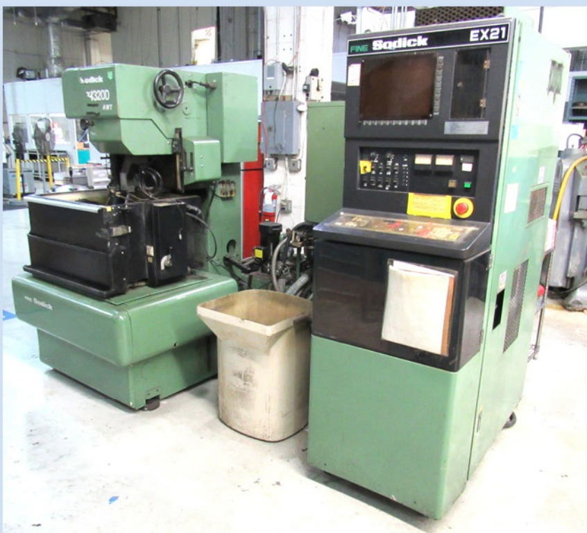
SODICK MODEL A320/EX21 WIRE EDM MACHINE