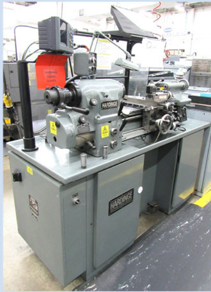
HARDINGE MODEL HLV-H PRECISION LATHE