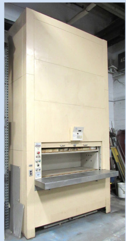
WHITE SERIES 2400 VERTICAL PARTS CAROUSEL