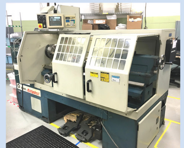
BRIDGEPORT-ROMI EZ PATH 20" x 40" CNC/MANUAL TEACH LATHE

Bid on this Auction at BidSpotter.com Thursday, Nov. 2