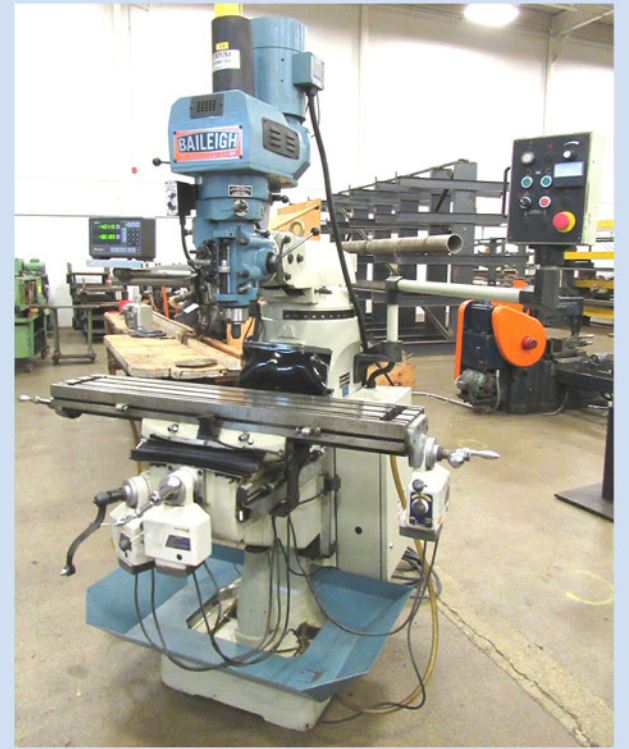
BALIEGH MODEL PBM-2EVS MILLING MACHINE