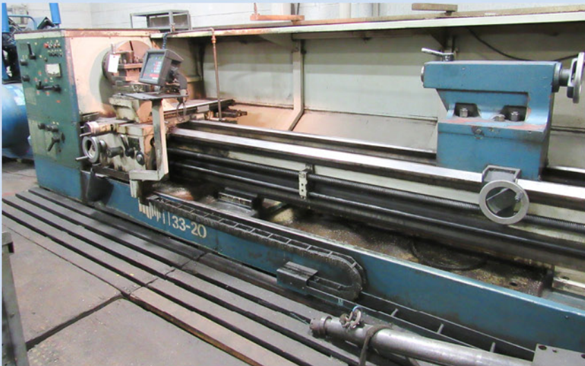
BRIDGEPORT-ROMI MODEL HDL33-20 33.5" x 140" LATHE