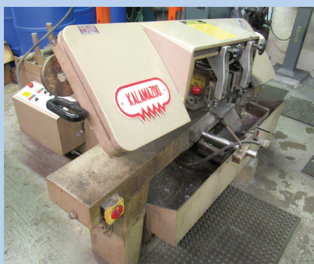
Kalamazoo Model AH9AW Automatic Band Saw