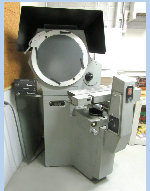
J & L Classic 20 Optical Comparator