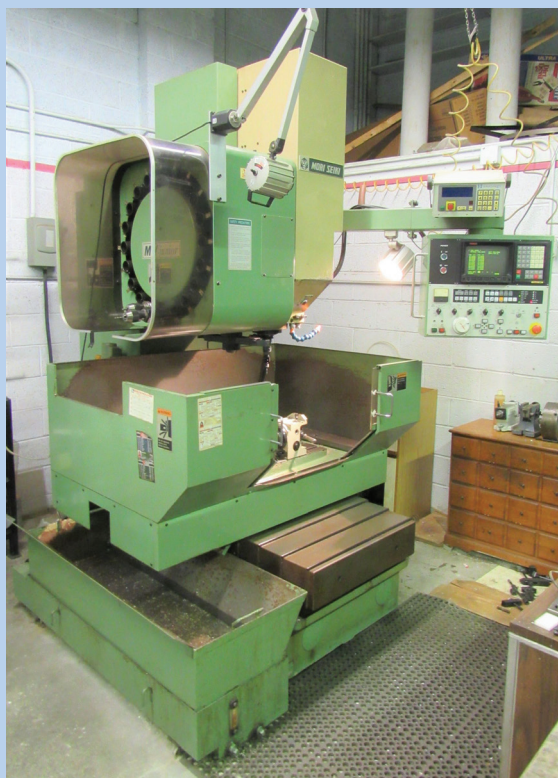
Mori Seiki Model MV-JR Vertical Machining Center