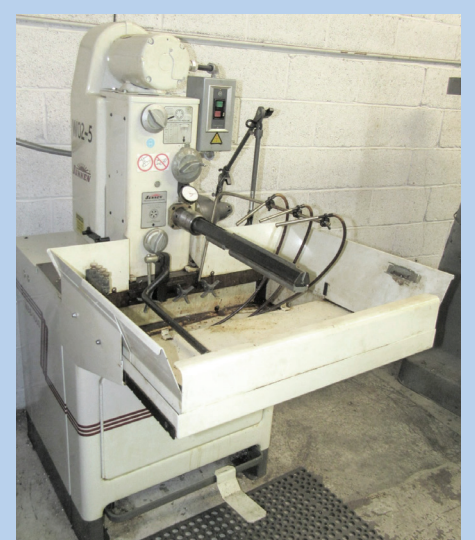
Sunnen Model MBB-1660D Precision Hone

Bid on this Sale at Bidspotter.com Tuesday, May 10 th , 2022 at 1:00 PM EST