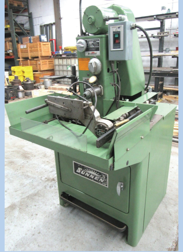
Sunnen Model 1660D Precision Hone