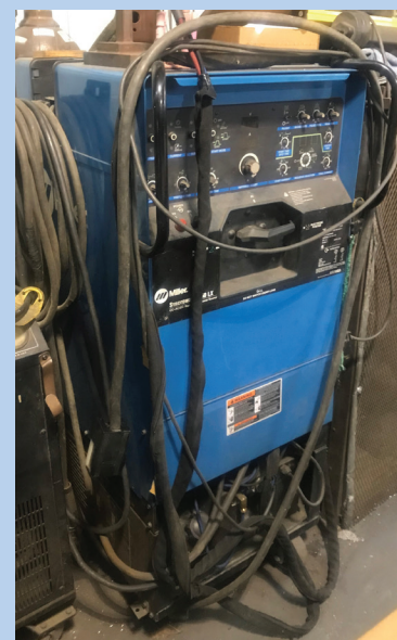
Miller Syncrowave 350LK Tig Welder