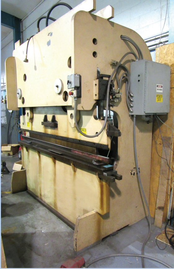
Allsteel 8' x 80 Ton Hydraulic Press Brake