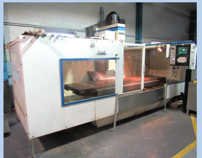
Fadal Model 8030HT Vertical Machining Center