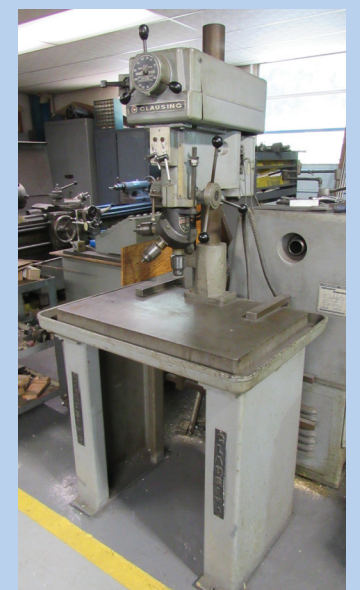
Clausing Model 1685 Vari-Speed Drill Press