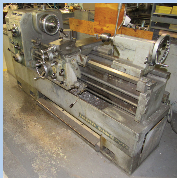
Howa Strong Model 1000 17" x 40" Geared Lathe