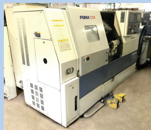
Daewoo Model 230B CNC Turning Center with Fanuc 21iT Control