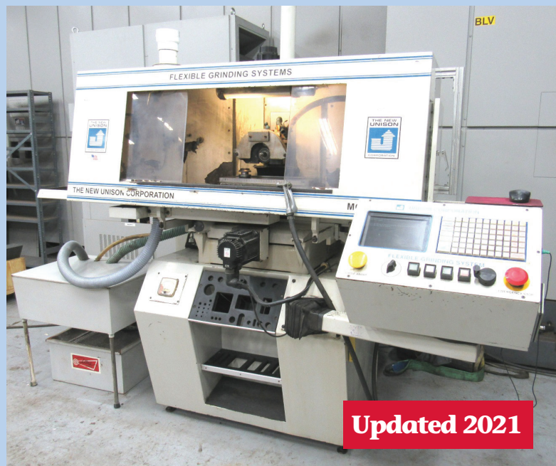
Unison Model 2000 3-Axis CNC Surface Grinder

Register at Bidspotter.com! Heavy Machining Plus: Accessories, Toolroom Machinery and Much More!