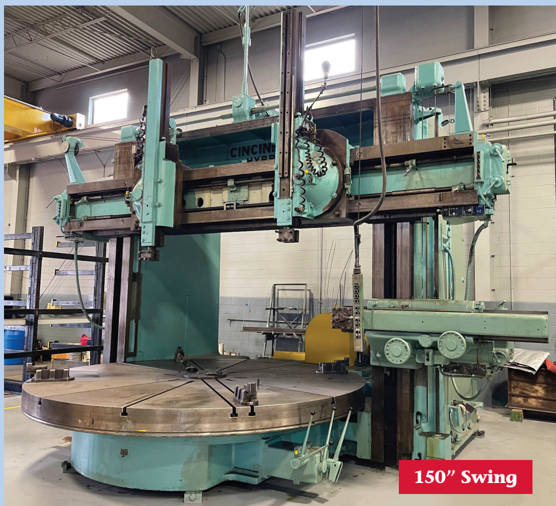
144" Cincinnati Hypro Vertical Boring Mill

Entire Inspection Department • Plus Much, Much More!