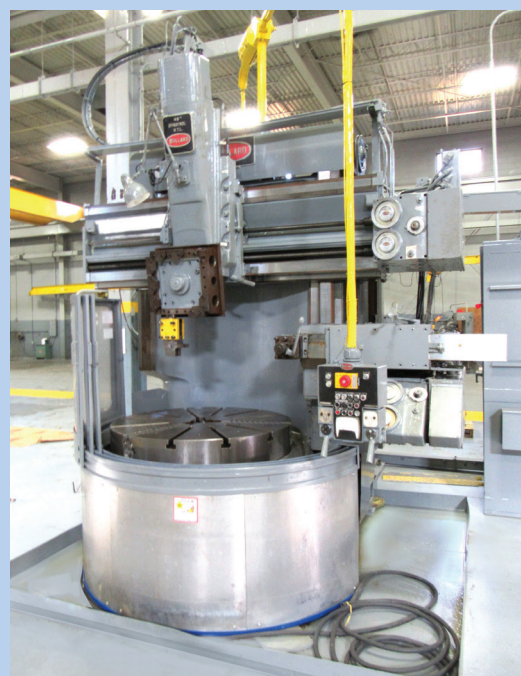
46" Bullard Dynatrol Vertical Turret Lathe