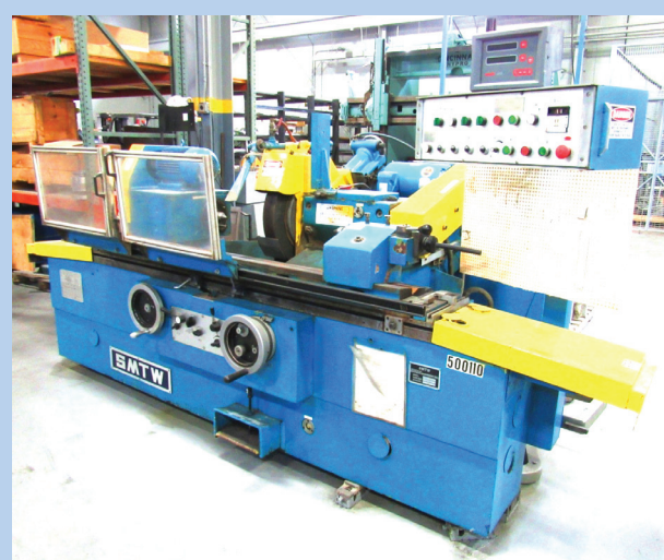
SMTW MB1332B 12" x 40" Cylindrical Grinder