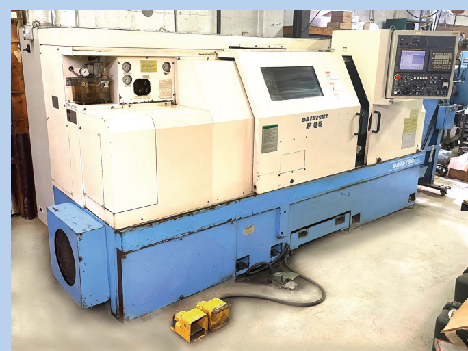
Dianichi Model F35 CNC Turning Center with Fanuc 21iT Control