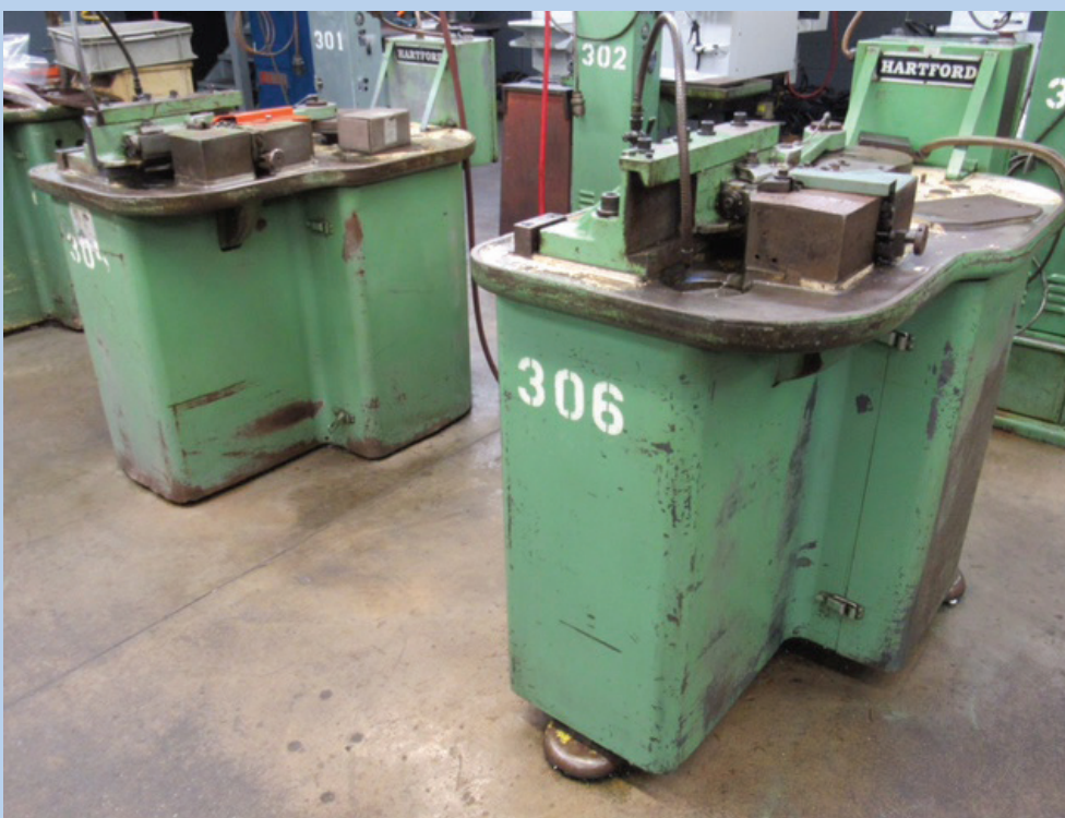
HARTFORD 190MV Thread Rolling Machine (3 Available)