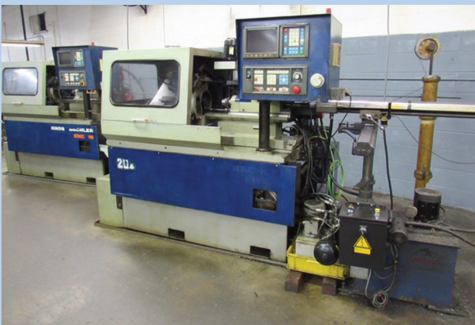
TORNOS-BECHLER ENC16T Swiss-Type CNC Screw Machines with Fanuc OT Control