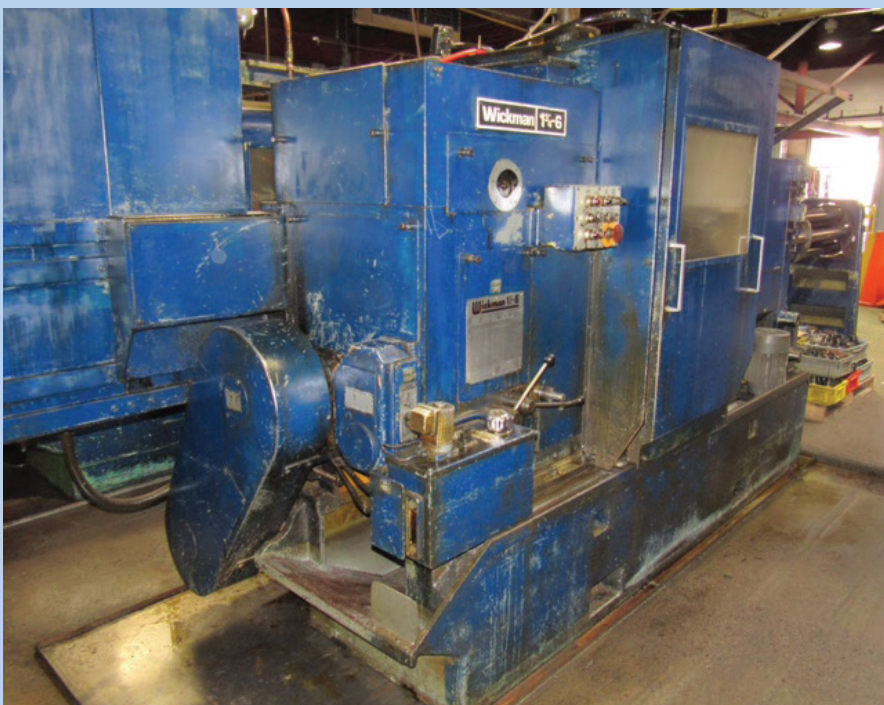
WICKMAN Automatic 6-Spindle Screw Machines (11 Available)