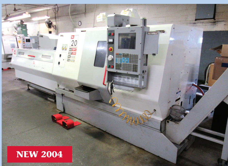
HAAS SL-20 CNC Turning Center with HAAS Bar300 Auto Barfeed