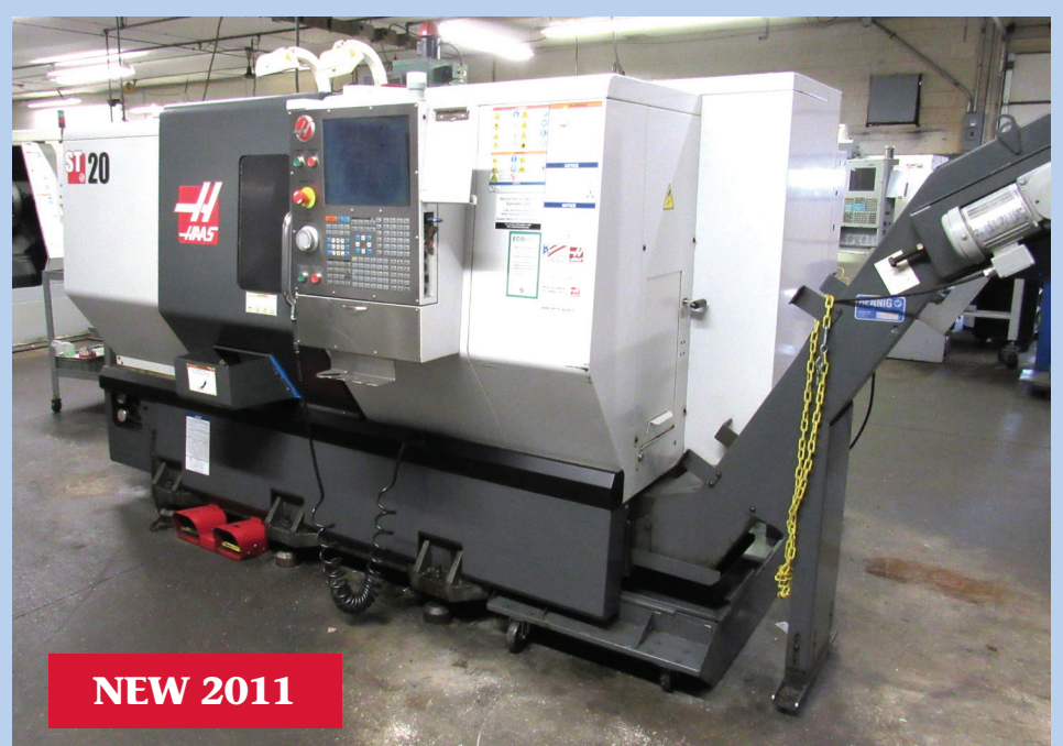
HAAS ST-20 CNC Turning Center