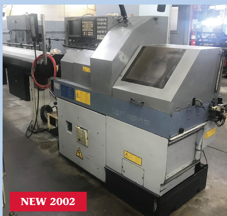
STAR SA-16R Swiss-Type CNC Screw Machine with LNS Express 220 Barfeed