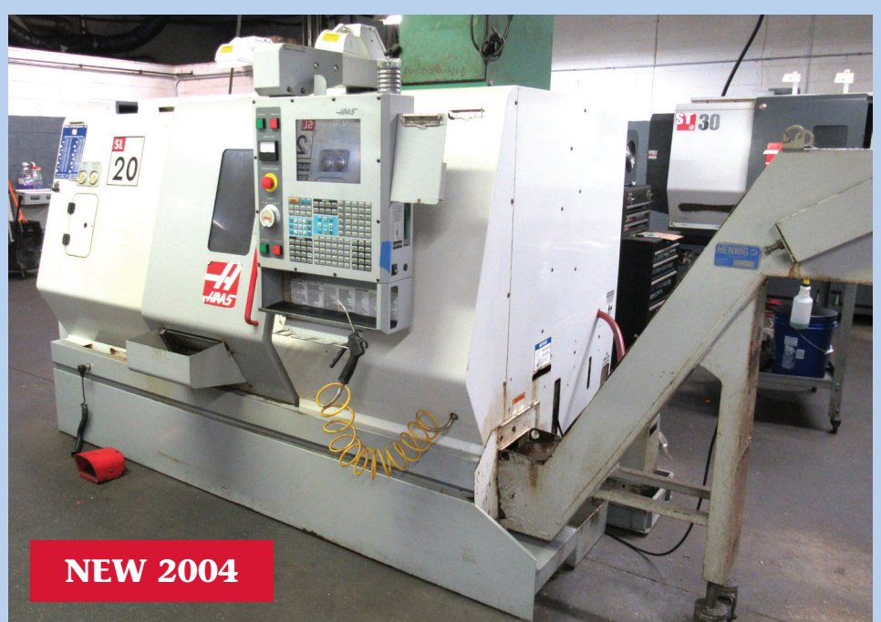
HAAS SL-20 CNC Turning Center