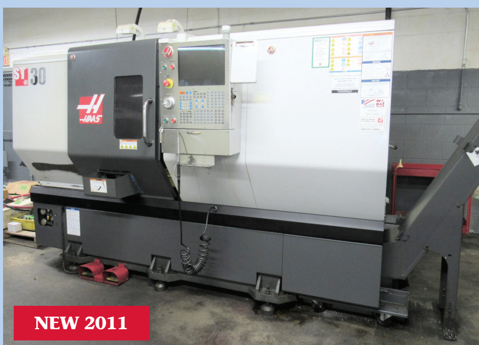
HAAS ST-30 CNC Turning Center

Bid on this Auction at www.BidSpotter.com