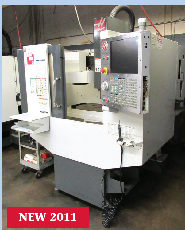
HAAS Mini-Mill 4-Axis Machining Center